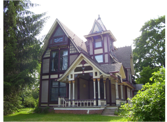
216 Huron circa 2009

Turn-of-the-century Lansing architect, Darius Moon designed and built this home for his family in 1893. This "Moon House" is a "stick-style" late Victorian home, a version of Queen Anne. Ornate on the outside, it is a functional family home on the inside. The abundant and elaborate wood detailing on the outside reflects a time period when wood was readily available. Stick homes are characterized by their absence of curves and use of straight lines. The home was originally located at 116 Logan St. and was scheduled for demolition after it was damaged by an apartment fire. A community-wide effort saved the home and it was moved to its present location in 1978. At this time it was placed on a new foundation, completely renovated, and added to the National Register of Historic Places. If one pays attention to the height of the current foundation it is easy to notice that this house was moved. The structure most likely had an original foundation of 30 inches in height. The recently selected colors were popular in the late 1800s. The signature porch is complete with stamped metal post capitals and a tin ceiling.