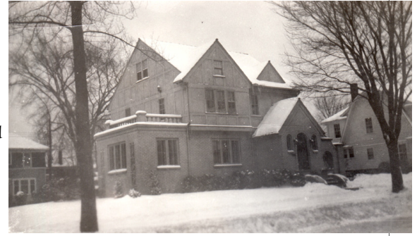
105 S. Jenison Right: 2009, Left: 1942