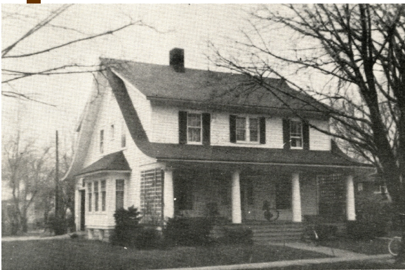
525 Westmoreland: Above: 1956, Right: 2009

Situated on three city lots, the central entryway and symmetrical windows and columns leave no doubt that the structure is Colonial Revival in form. The false eaves scooped at the eave line create a cottage appearance however the roofline parallel to the sidewalk further evidences Colonial Revival style. Arts and Crafts styling is present through the six-over-one and eight-over-one windows. The massive porch, partially backed into the house structure, is dominated by four prominent Tuscan columns that continue the symmetry of the house. Completed in 1918 by the Ayres' family, 525 Westmoreland was one of the first two houses built on Westmoreland. The original owner of this home, Leon B. Ayres, was heavily involved with Lansing real estate. He served as the secretary-treasurer of the Standard Real Estate Company, a company that offered real estate, insurance, and loans. Standard Real Estate Company was the owner of none other but the Westmoreland Subdivision, among others, where 525 Westmoreland is located. Besides his position at Standard Real Estate Company, Leon served as president