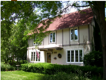
1326 N. Genesee: Right: 1938, Above: 2009