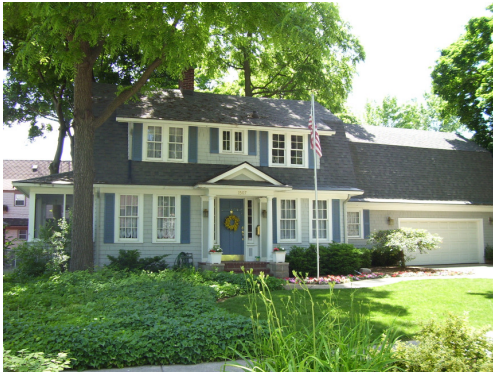
1507 S. Genesee circa 2009