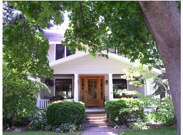
605 Westmoreland circa 2009