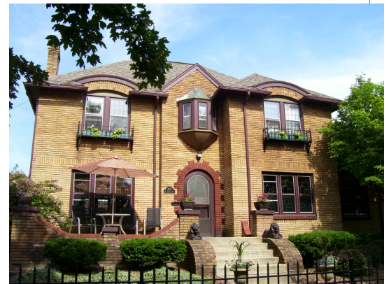
405 S. Jenison circa 2009