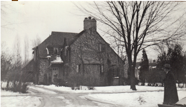
516 Carey: Left: 1942, Right: 2009