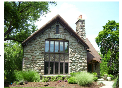
1306 N. Genesee circa 2009