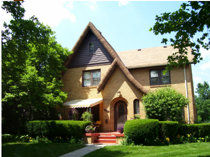
1600 W. Kalamazoo Left: 2009, Right: 1937