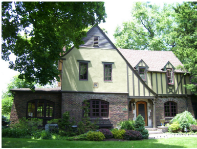
505 Carey circa 2009