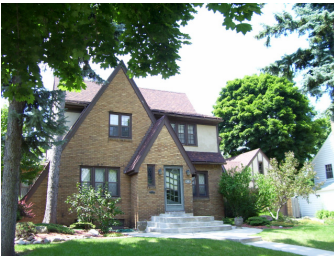
446 Everett Right: 2009, Left: 1943