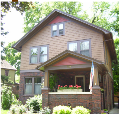
511 Carey circa 2009