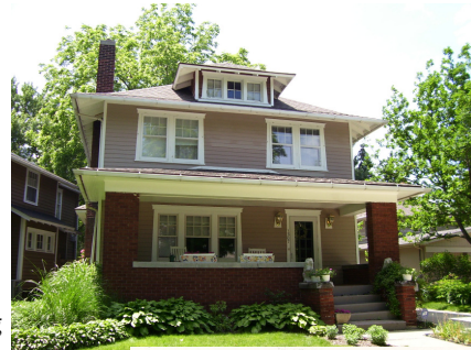
1307 S. Genesee Top: 2009 Bottom: 1948