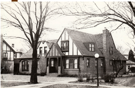
1316 N. Genesee: Above: 1948, Right: 2009