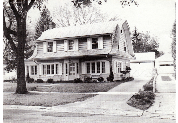
411 Carey: Top left: 1958, Bottom right: 2009