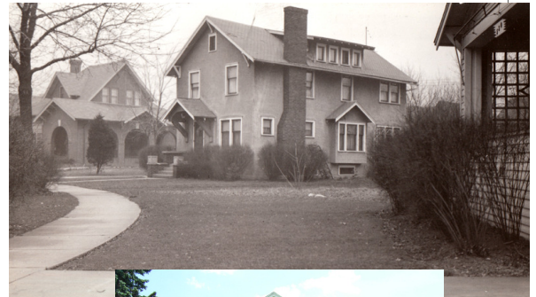
536 Dinsmore Dr.: Top: 1936, Right: 2009