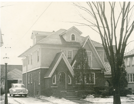
1515 W. Kalamazoo Right: 1950, Left: 2009