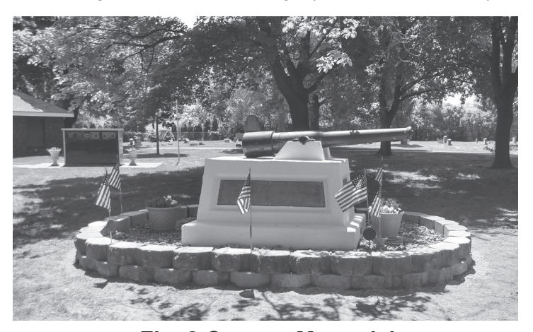
Fig. 2 Cannon Memorial

With many thanks to the Eaton County Sheriff's road crew for a job well done, the newly restored monument again stands with pride. As is fitting to the memory of all our veterans, the monument displays the appearance of a well-cared-for and wellloved memorial. The work was completed by Memorial Day, and the flags continue to wave brightly for this Veterans Day.