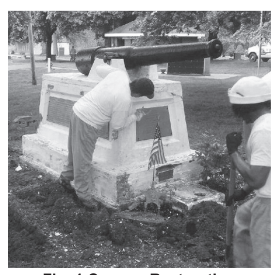
Fig. 1 Cannon Restoration

The dedication was a big event, held on the Saturday closest to Memorial Day in 1911. According to a story in the Lansing State Journal (27 May 1911; 29 May 1911), nearly 300 people assembled to witness the unveiling of the memorial, which was presented by the ladies of the Cemetery Association of Delta. The ceremony was conducted by the Charles T. Foster Post of the GAR of Lansing and included the Foster Post Drum Corps. Following the ceremony, a picnic lunch was held at the town hall, and after that a camp fire and program of vocal music and speakers concluded the day. The music included performances