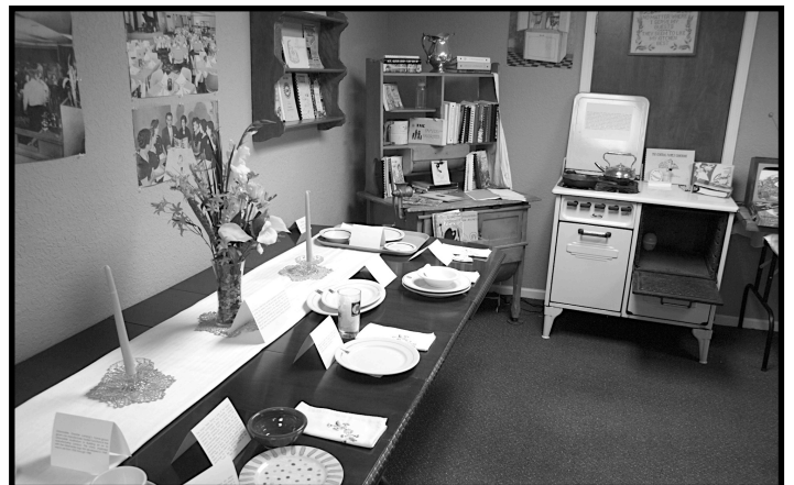
Part of our current exhibit - Lansing Eats!