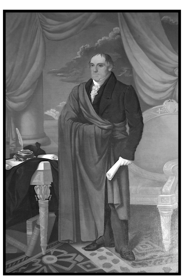
Michigan Senate Cass Portrait

this portrait hung proudly in the Senate chambers with no one questioning its origin. During the restoration of the Michigan Capitol in the late-1980s and early-1990's, an art historian noticed the Cass portrait and recognized that something seemed too familiar in this portrait. Looking at the Cass portrait it is difficult not to notice the similarities to a portrait of George Washington by Gilbert Stuart, painted in