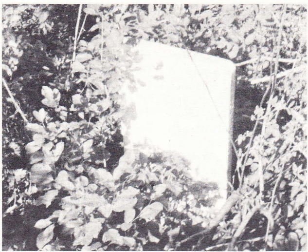
One of a few remaining stones in Richmond Cemetery

Views of cemeteries in Clinton Coun- ly surrounded by farmed land, and ty — The Richmond Cemetery is about nearly obscured by trees and brush. as big as someone's backlot, complete- Only the rugged lilac bushes in spring-