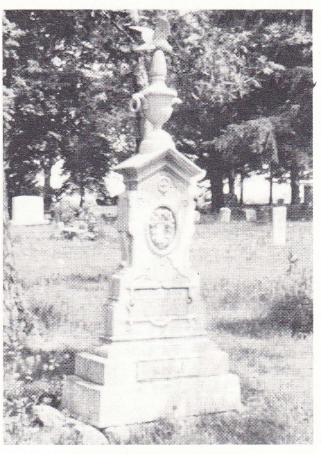
2 shots of cast metal markers well preserved and quality examples of outdoor sculptures.

The Clinton County Historical Commission urges citizens to request aid for uncared for and damaged burial grounds from their township supervisors. Assistance is available through CEATA funded workers and the Community Development program.