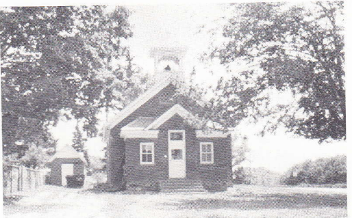
Old Gunnisonville School

Now it is used regularly as a demonstration classroom and a public meeting place for fifty or less people.